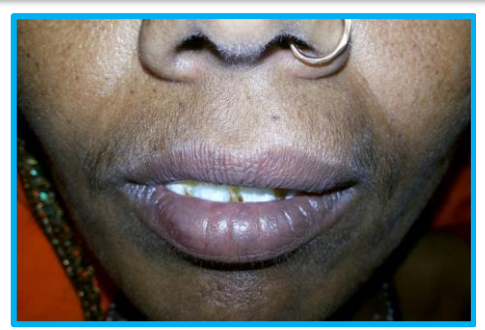
Fig. 1: Extraoral examination showing swelling of left side of upper lip